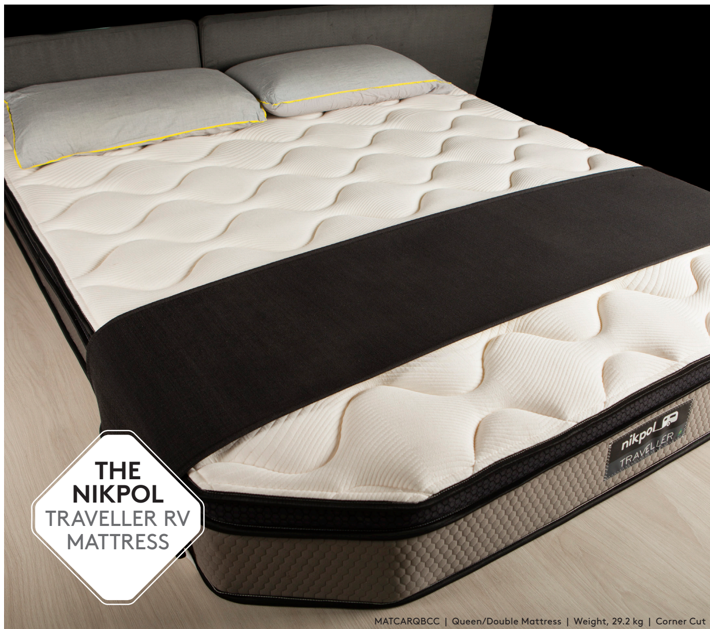
MATCARQBCC | Queen/Double Mattress | Weight, 29.2 kg | Corner Cut