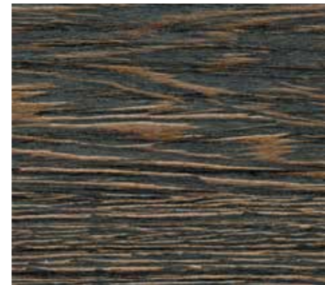
EGGER | H3058 ST22 MALI WENGE