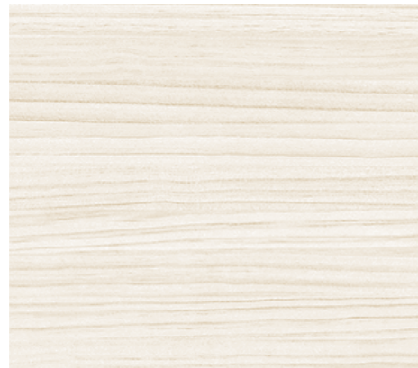
EGGER | H3078 ST22 HACIENDA WHITE