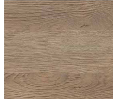
EGGER FEELWOOD | H3326 ST28 GREY BEIGE GLADSTONE OAK