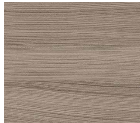
EGGER | H3090 ST22 DRIFTWOOD