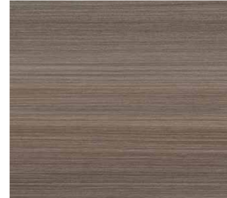
EGGER | H3077 ST22 CERAMIC GREY BEIGE