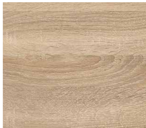
EGGER | H1145 ST10 NATURAL BARDOLINO OAK