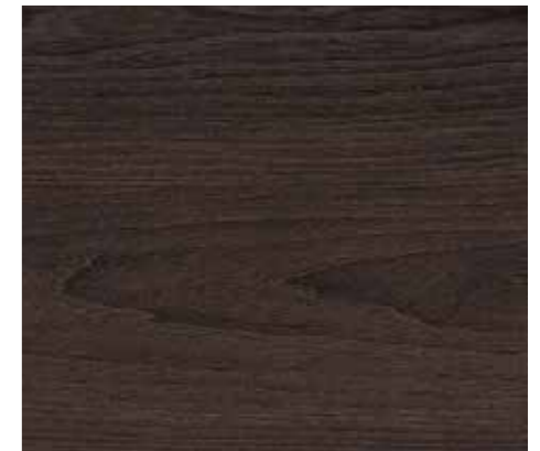
EGGER FEELWOOD | H3766 ST29 DARK BROWN CAPE ELM