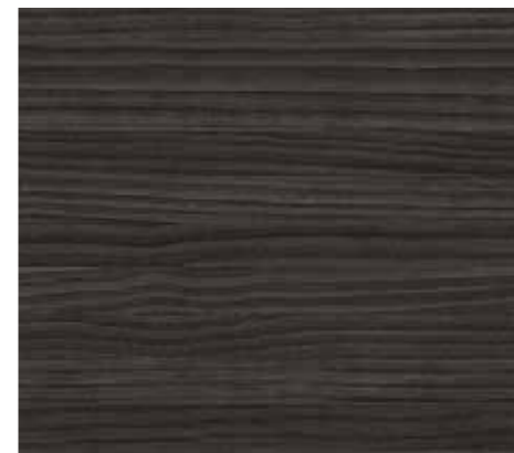
EGGER | H3081 ST22 HACIENDA BLACK