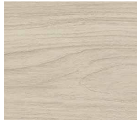
EGGER FEELWOOD | H3760 ST29 WHITE CAPE ELM