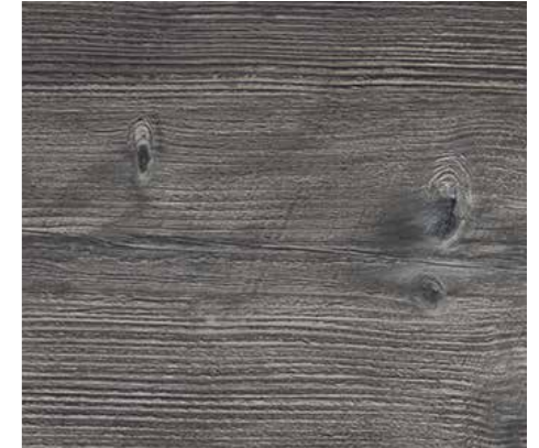
EGGER FEELWOOD | H1486 ST36 JACKSON PINE