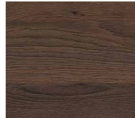
EGGER FEELWOOD | H3325 ST28 TOBACCO GLADSTONE OAK