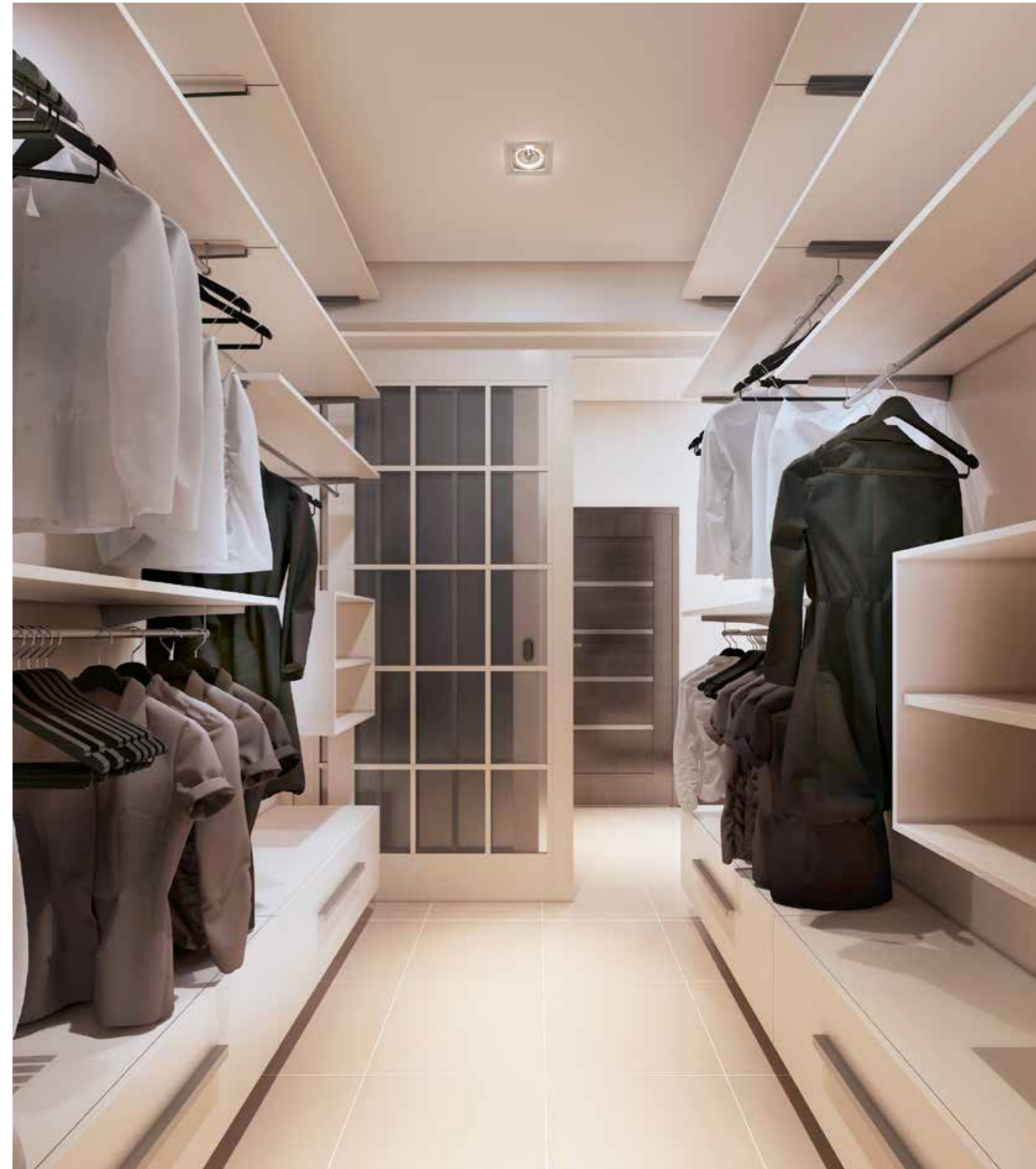
EGGER W1200 ST9 Porcelain White, 18mm & 25mm Melamine Board.

Nikpol offers an express sample service. Visit www.nikpol.com.au to order complimentary laminate samples.