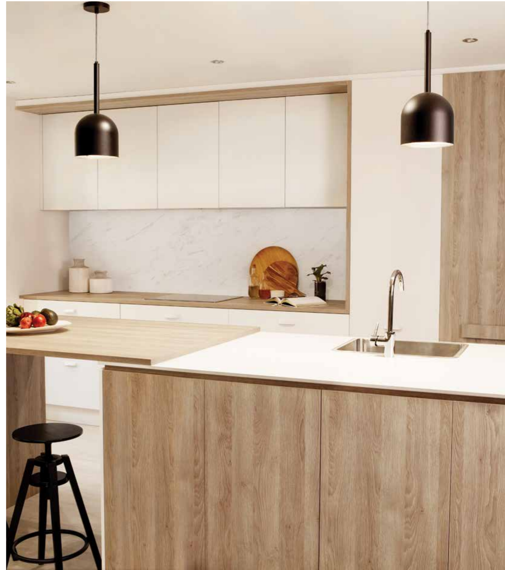
EGGER Feelwood H3326 ST28 Grey Beige Gladstone Oak, 18mm & 25mm Melamine Board.