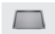
Enameled baking tray